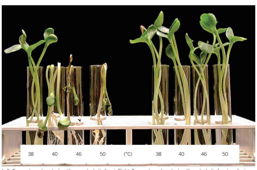
Left: Four watermelon plants with no endophytic fungi; Right: Four watermelon plants with endophytic fungi conferring heat stress tolerance.

"There are high-stress habitats all around the world - some of them are drought stress, some of them are salt stress,